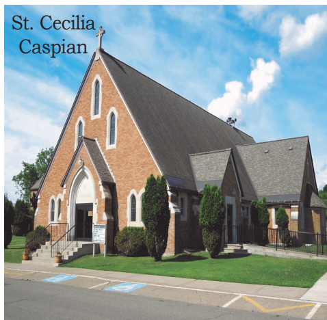
St. Cecilia Caspian